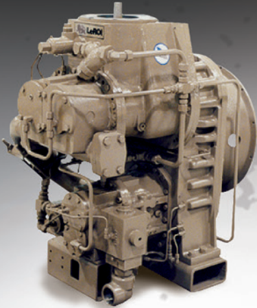
HGT17 Compressor with Bell Housing and Versatrol